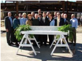
SPCH & Mission Board

The expansion project is currently on schedule and expected to be completed by November of 2007. Patients will then be transferred to the new wing and renovation of the existing building will begin. The entire project should be completed by March of 2008.