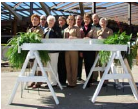
SPCH Fdn. Board

On March 2, 2007 over 200 people, including the Spruce Pine Community Hospital Board, Foundation Board, major donors, and other members of the community, celebrated the completion of the steel infrastructure for the hospital expansion by signing the last steel beam. The beam, carrying the American flag, was hoisted up by crane, set in place and then topped with an evergreen tree.