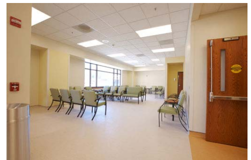
New ED waiting area

Since opening the ED staff has treated well over 2,000 patients. Wait times have increased temporarily during the transition, but are still substantially below the national average.